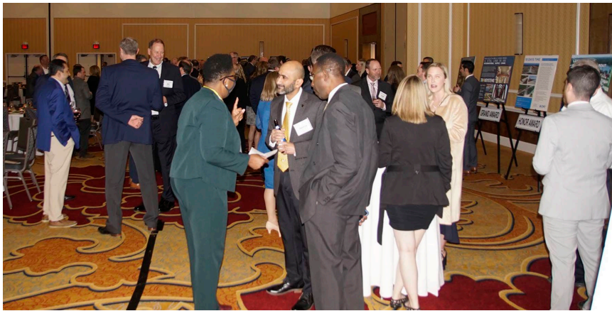
Members had a chance to network during the design excellence reception as well as review the winning EEA project display panels.