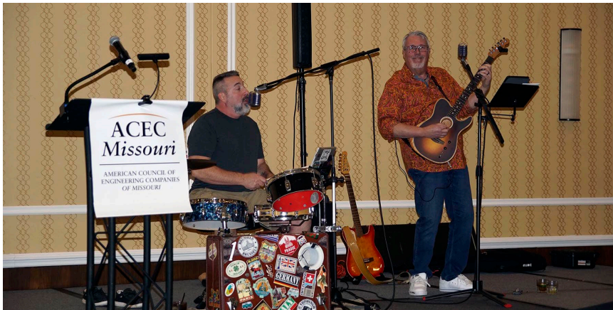
Those Guys provided great entertainment during our awards reception and after the banquet.