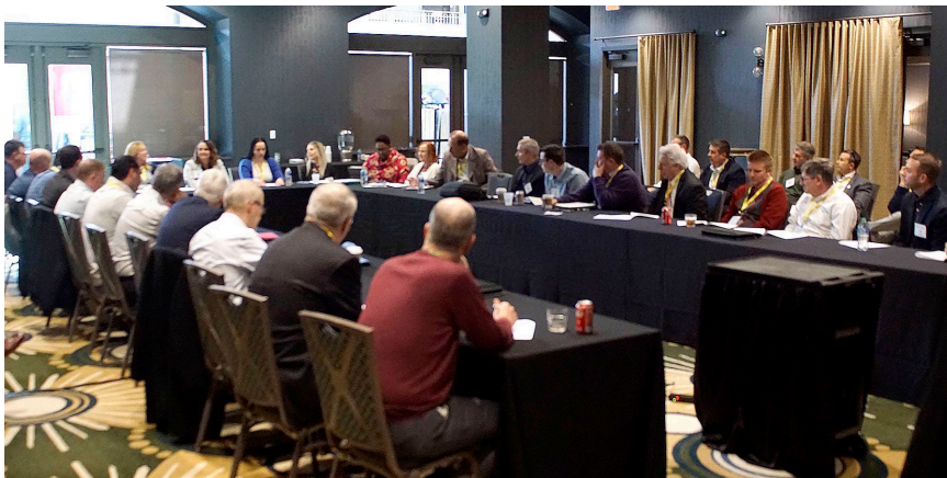
Members attended the CEO Roundtables, and they were again highly informative with a large list of items for discussion for small and large firms.