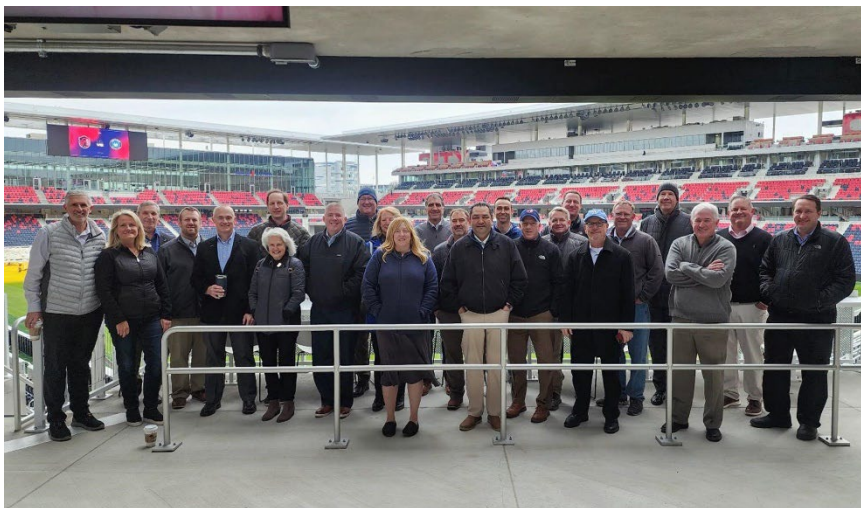
A group of ACEC/MO members were taken through a tour of the St. Louis City SC's Stadium.