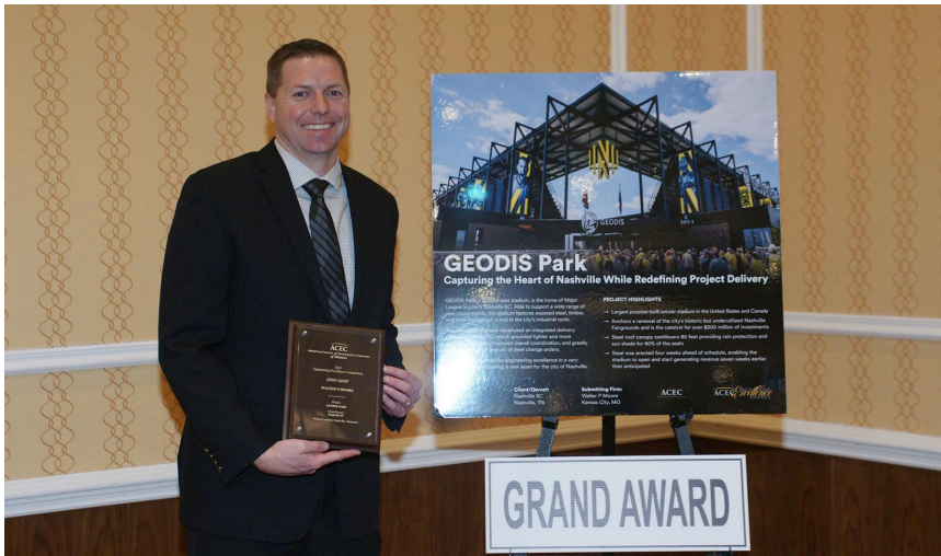
GRAND AWARD Walter P Moore and Associates, Inc. Project: GEODIS Park