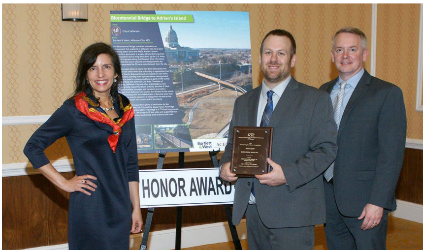
HONOR AWARD Bartlett & West, Inc. Project: Bicentennial Bridge to Adrian's Island

groups. To learn more information on this coalition, click here .