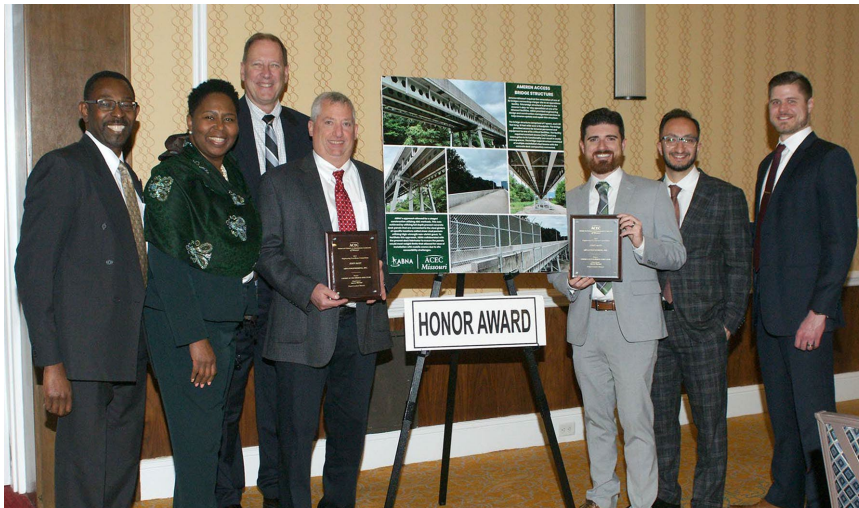
HONOR AWARD ABNA Engineering, Inc. Project: Ameren Access Bridge Structure