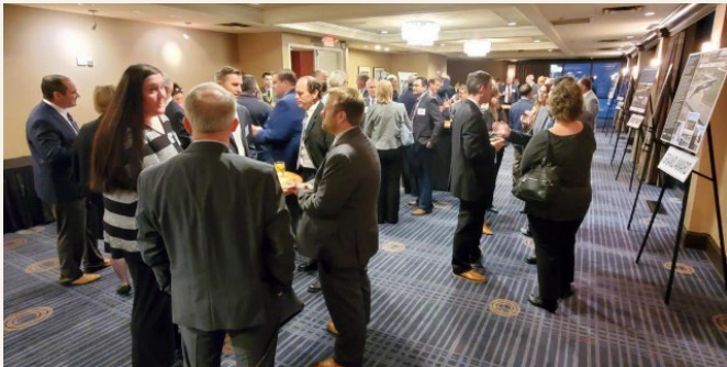
Members attended our annual Awards Reception to honor EE award winners.