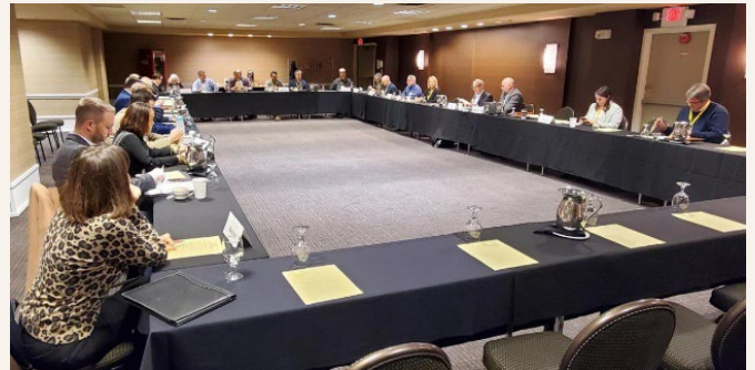
Quarterly Board of Directors / Membership Meeting.