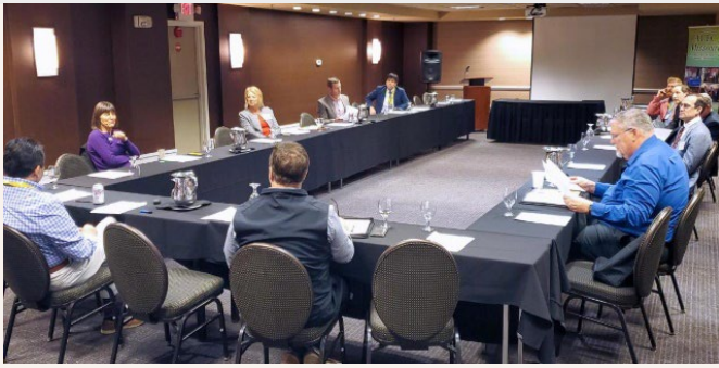
CEO Roundtable (Small/Medium Firms).