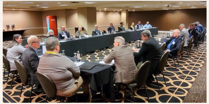
CEO Roundtable (Medium/Large Firms).