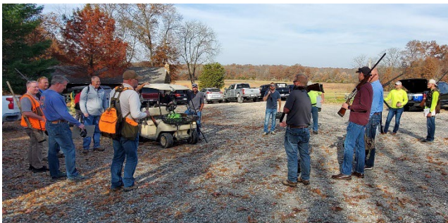
ACEC/MO held its 1st Annual Sporting Clays Tournament benefiting ACEC/PAC.

We had a great turnout for ACEC/MO's Fall Meeting & 1st Annual Sporting Clays Tournament on November 3-4, 2022, in Columbia. Included with the meeting was a Rocheport Bridge Site Visit. Below are photo highlights from the meeting.