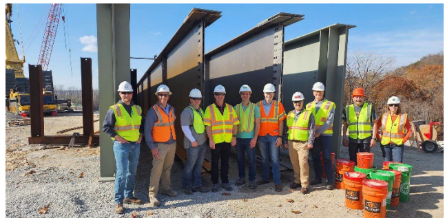
ACEC/MO members did a site visit with MoDOT of the Rocheport Bridge.