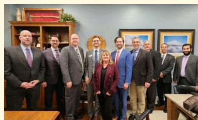
Participants met with Senator Lincoln Hough to discuss I-70 and transportation infrastructure funding.