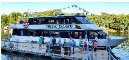
Members enjoyed drinks and dinner on a cruise on the Lake of the Ozarks.