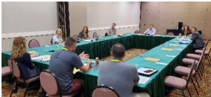
The Engineering Excellence Committee met and discussed judges for the upcoming 2023 EEA competition.