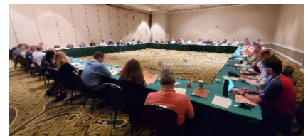
ACEC/MO members attended the Board of Directors / Membership Meeting to discuss items of interest.