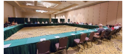
The Governmental Affairs Committee met and discussed legislative items of interest to members.