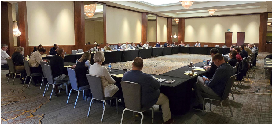
Our quarterly Board of Directors / Membership Meeting was held.