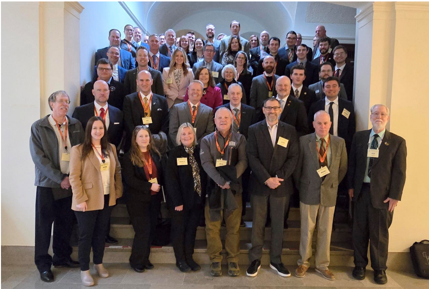
A productive day advocating for infrastructure and engineering at the Missouri State Capitol. 100 engineers roamed the halls meeting with numerous senators and representatives, Speaker of the House and even a former US Senator.