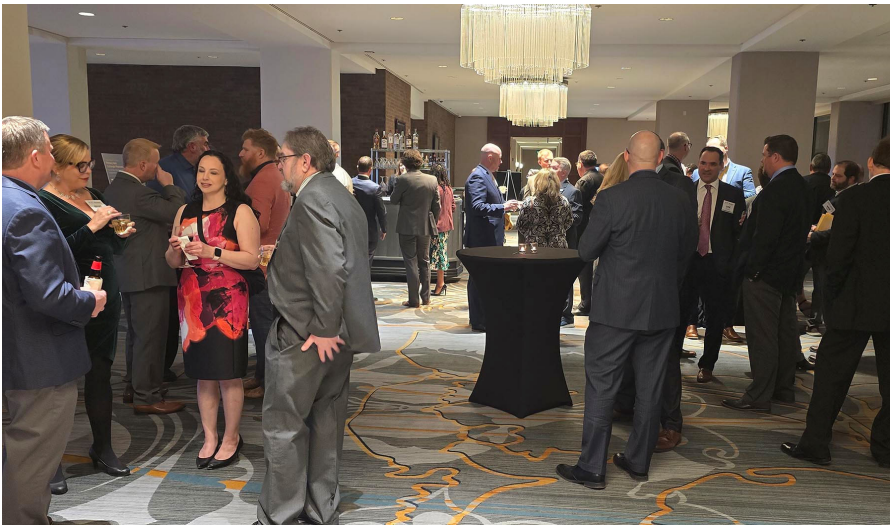
Members, guests and clients had a chance to network during the design excellence reception, while reviewing the winning EEA project display panels.